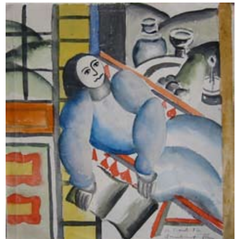
Fernand Léger, Study for Woman and Child , 1922