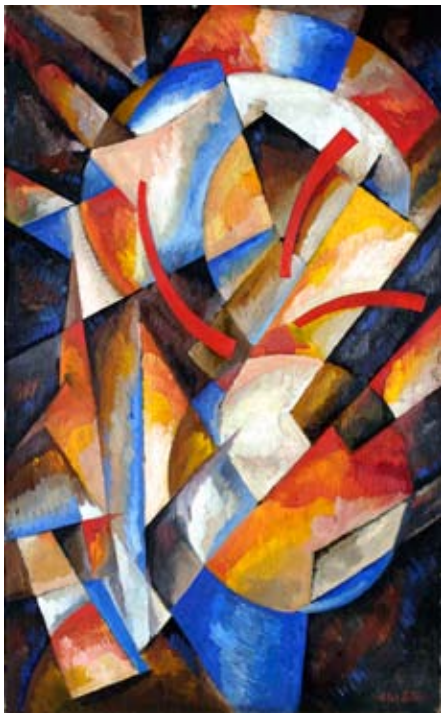
Alexandra Exter, Dynamic of Colours , circa 1917-18 Signed lower right, Oil on canvas, 125 x 77 cm

Hans Arp, Marc Chagall, Jean Dubuffet, Sonia & Robert Delaunay, Alexandra Exter, Frantisek Foltyn, Albert Gleizes, Wassily Kandinsky, Frank Kupka, Fernand Léger, André Masson, Joan Miro, Wolfgang Paalen, Pablo Picasso, Ivan Puni, Antoni Tapiès, Toyen, Maria Elena Vieira da Silva, Otto Wols.