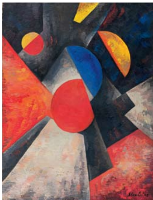
Alexandra Exter (1882-1949)

Abstract Composition, Colour Rhythms , 1917-1918